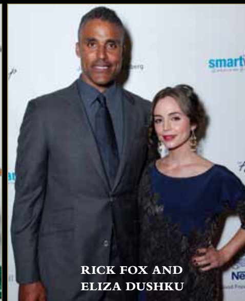
RICK FOX AND ELIZA DUSHKU