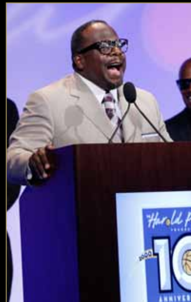
CEDRIC THE ENTERTAINER