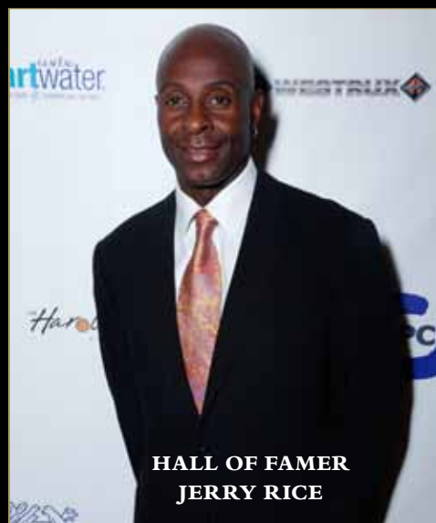
HALL OF FAMER JERRY RICE

Or maybe it really is all about relationships...and communication...and getting the good work done. ■