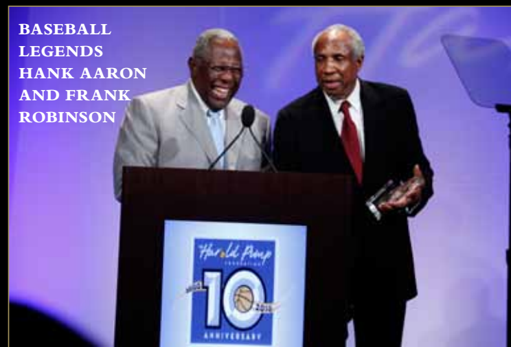
BASEBALL LEGENDS HANK AARON AND FRANK ROBINSON