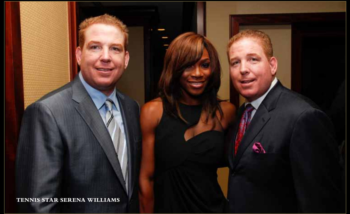
TENNIS STAR SERENA WILLIAMS